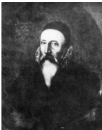
JOHN DEE 1527-1608