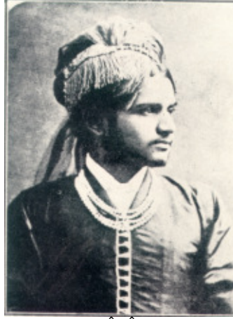
HIS HIGHNESS DAJI RÂJÂ CHANDRA SINGHJEE μhâkur Sâhib of Wadhwân ?-1885

(Consult Appendix for biographical sketch.)