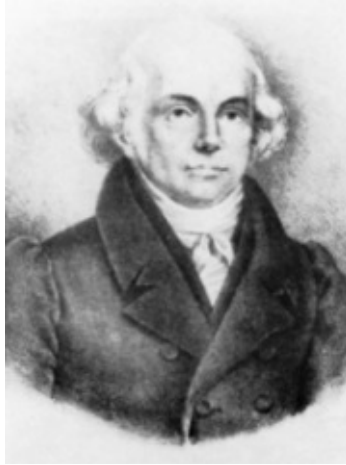
DR. SAMUEL CHRISTIAN FRIEDRICH HAHNEMANN 1755-1843

procession, going in quite a proper manner” . . . . . In his cross-examination, the following facts were disclosed:—“There were girls and women of all ages. I went right through the procession from beginning to end. I looked as well at everything as I could, and I saw nothing objectionable . . . . . Buddhists have had, I am informed, a general permit for a procession in the month of March, but in my mind there was a doubt whether they should have it on Good Friday and Saturday, and I saw some leading Buddhists, and they agreed not to have any on those days, to avoid annoying the Catholics. They then pressed for one for Easter Sunday . . . . . I consulted the R. C. Bishop, who said there would not be the slightest objection to the