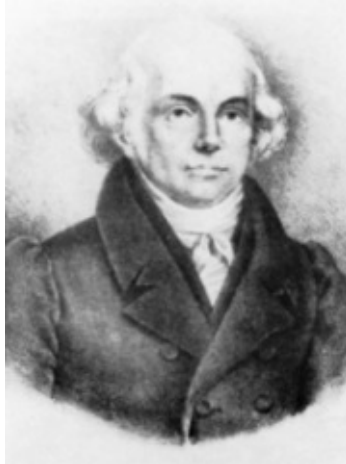
DR. SAMUEL CHRISTIAN FRIEDRICH HAHNEMANN 1755-1843