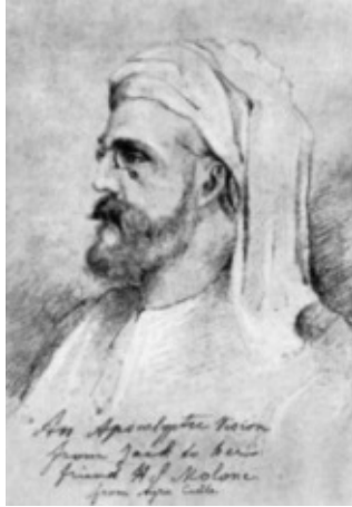
DRAWING OF H.S. OLCOTT BY H.P.B.

Crayon drawing made by H.P.B. around 1877, the original of which is in the Adyar Archives. “Moloney” was H.P.B.’s nickname for Col. Olcott, while his nickname for her was “Mrs. Mulligan.” Reproduced from The Theosophist , Vol. LII, August, 1931.