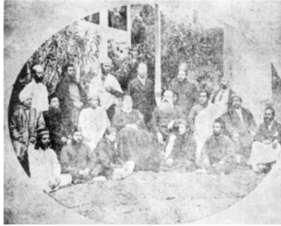
CONVENTION GROUP, BOMBAY, 1882