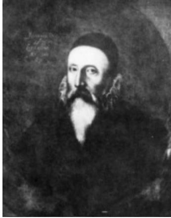
JOHN DEE 1527-1608