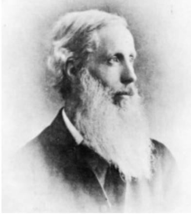
HENRY SIDGWICK 1838-1900

Reproduced from the Proceedings of the Society for Psychical Research, Vol. XV, Pt. XXXIX