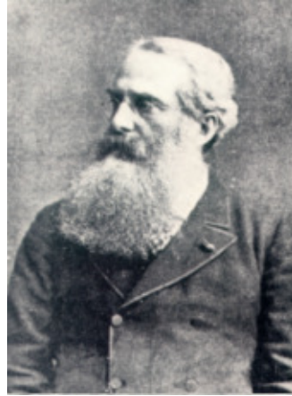
COL. HENRY STEEL OLCOTT