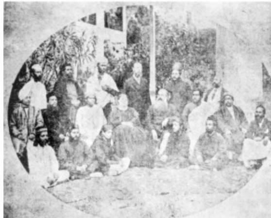
CONVENTION GROUP, BOMBAY, 1882