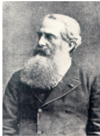
COL. HENRY STEEL OLCOTT Reproduced from The Path , New York, Vol. V, May, 1890.

Nothing can have “ no beginning and yet have an end” in the literal sense. This is contrary to all metaphysical teaching and logic. Ahriman, or Evil, “had no beginning,” because no more than spirit had matter any beginning. Were they “two co-eternal beings ”—this would be a fallacy. But Matter and Spirit are one—the former at the lower, the