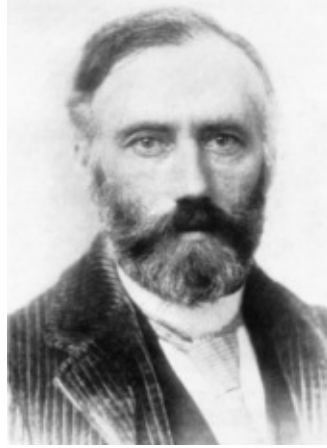
WILLIAM QUAN JUDGE April 13, 1851—March 21, 1896

What are the “producers” evolved from this universal root-principle, Mula-prakriti or undifferentiated primeval cosmic matter, which evolves out of itself consciousness, and mind, and is generally called “Prakriti” and amulam mulam , “the rootless root,” and avyakta , the “unevolved evolver,” etc.? This primordial tattwa or “eternally existing ‘that’,” the unknown essence, is said to produce as a first producer (1) Buddhi —“intellect”—whether we apply the latter to the sixth macrocosmic or microcosmic principle. This first