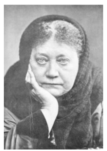
HELENA PETROVNA BLAVATSKY Portrait taken by Enrico Resta, January 8, 1889, in his Studios at 4, Coburg Place, Bayswater, London W. The original glass plate, together with five others taken at the same time, were sold by him in 1942 to The Theosophical Society in England, and are now in its Archives.