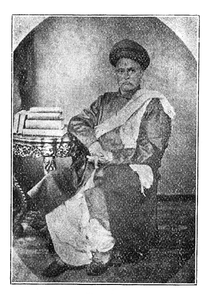
Fig. 70 GOPALRAO HARI DESHMUKH