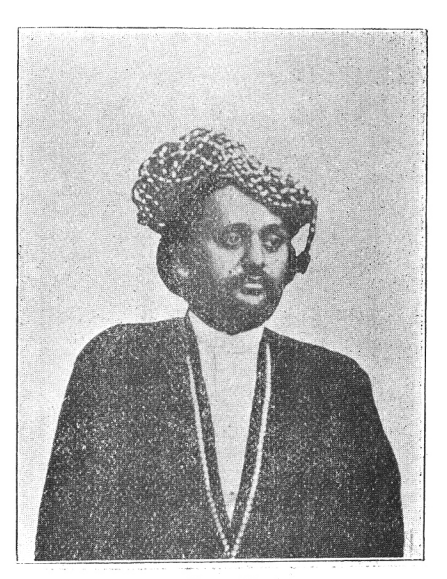
Fig. 69 PRINCE HARISINGHJEE RUPSINGHJEE