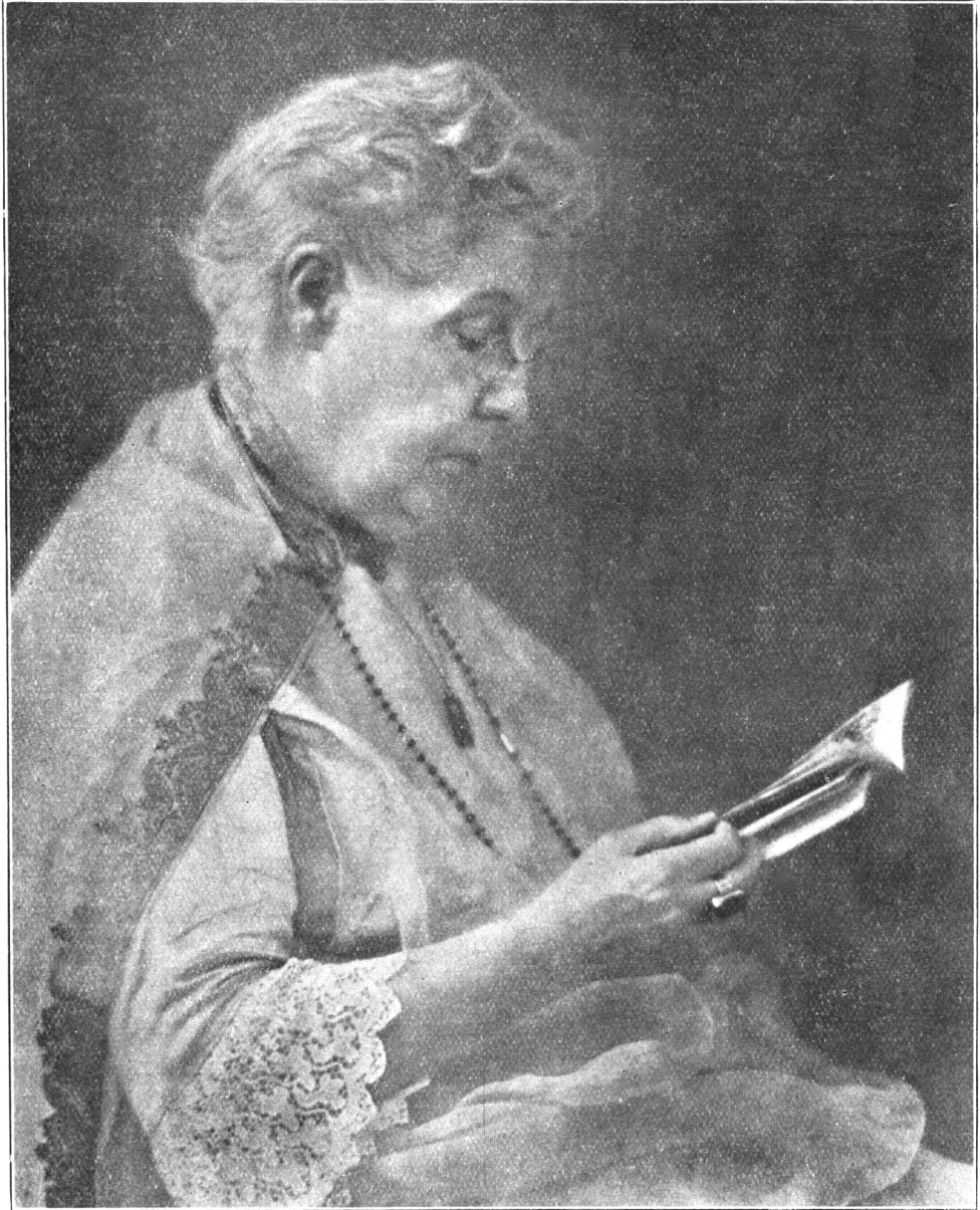
FIG. 195 DR. ANNIE BESANT